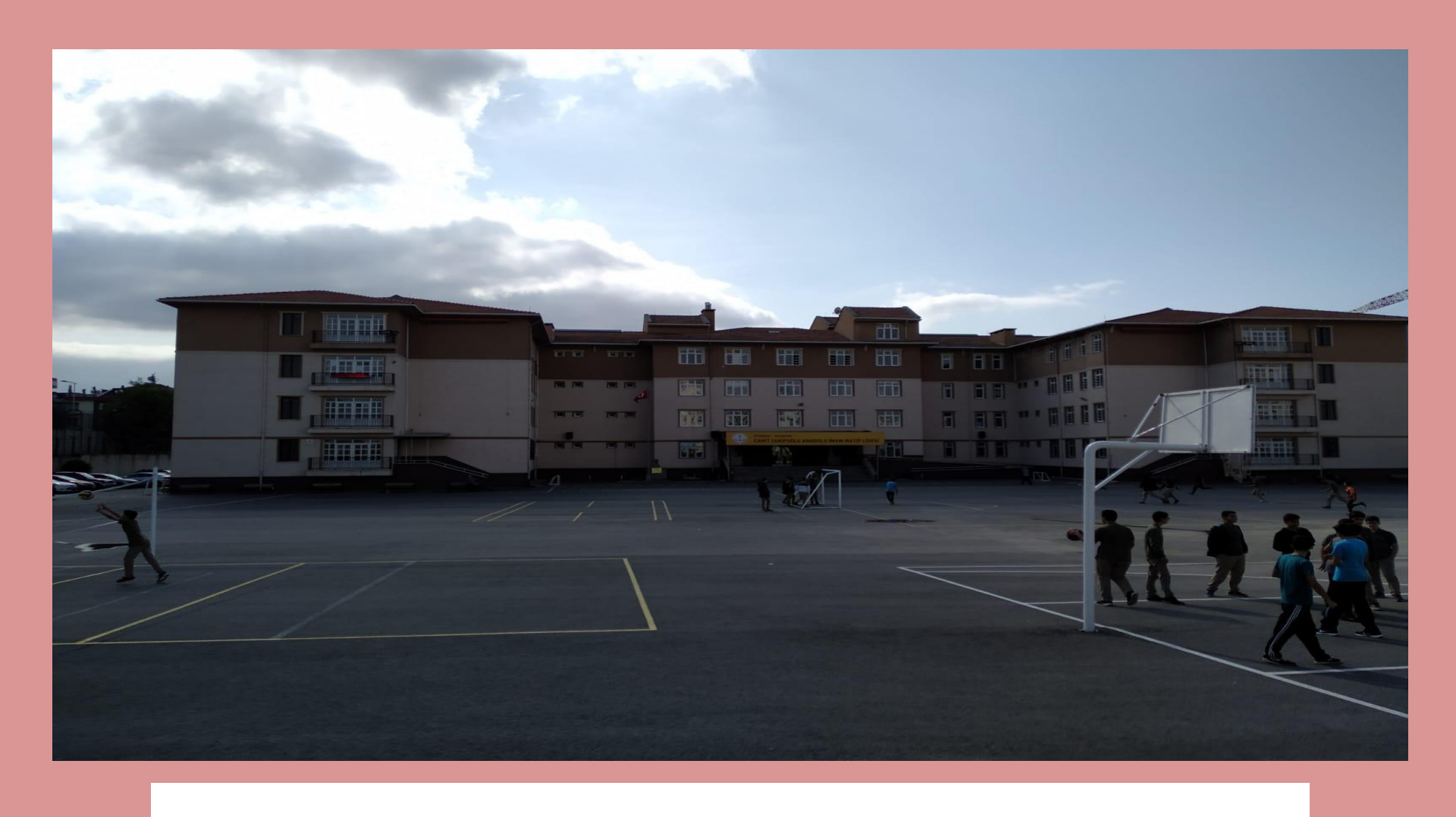
First of all I want to talk about our garden. It is huge!